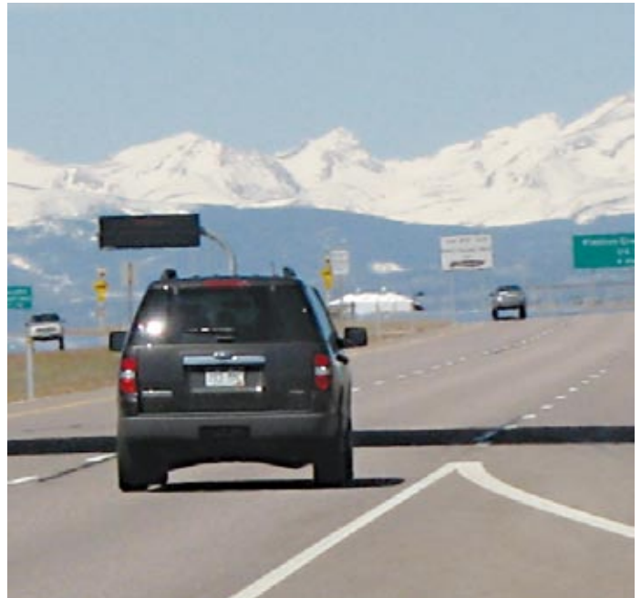
Completion of the C-470 beltway and an effective transportation infrastructure continue to rate high on JEC's list of priorities.